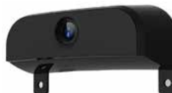
Thermal Sensor Module

tagitalia.it www.generalesistemi.it tbs-biometrics.com